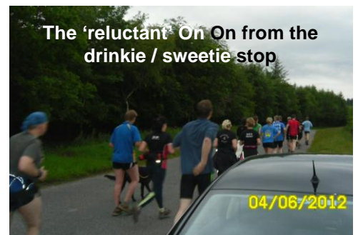
The 'reluctant' On On from the drinkie / sweetie stop

"On On when ready" to a Long / Short split, until, after being ignored for so long, it was a case of - "RIGHT! WILL YOU ALL FECK OFF!!!" So we did!