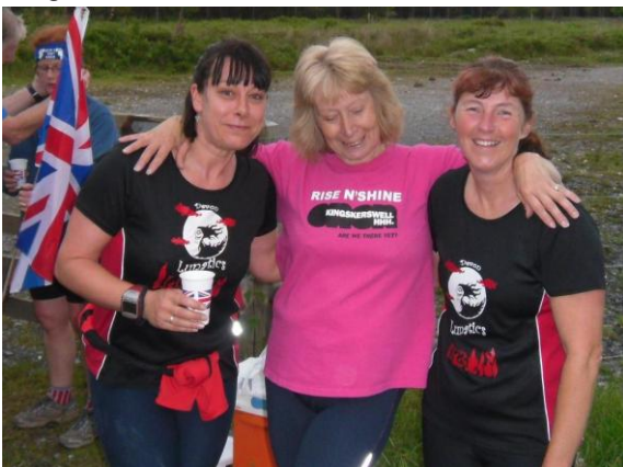
PP, Rise 'n' Shine and Mateus Rosie

The Shorts basically followed the road to On Home, and the Longs had a final burst through the trees. It was during this last part that Kura whistled past us - Slippery in tow, down a slope and through a small gap between two trees. Slippery