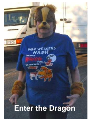
Enter the Dragon