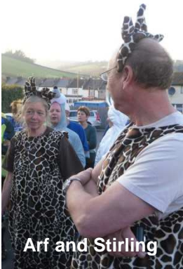
Arf and Stirling

Trail and On Down: Noah's Ark Inn, Paignton – Theme Noah's animals 2 x 2 Hares / 'Giraffes': Arfanar and Stirling Toss (Virgin Lay)